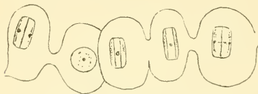
Fig. 2. Thalassiosira monile , a chain 250 t. m.

The cellules occur inbedded in globular gelatinous masses, united into moniliform colonies. The pervalvar axis shorter than the diameter of the valve. The alveoli of the valve have the same arrangement as in Coscinodiscus excentricus , about 12 in 0,01 mm., somewhat closer near the margin, which is provided with a row of small tubercules, 3,5 in 0,01 m.m. Between the central alveoli there is a small porus. The cylindrical part of the valve as well as the zone is very finely striate (29 striae in 0,01 m. m.).